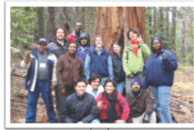
2008-09 Humphrey Fellows